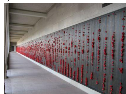
Roll Of Honour WW1 Australian War Memorial Canberra, Australia