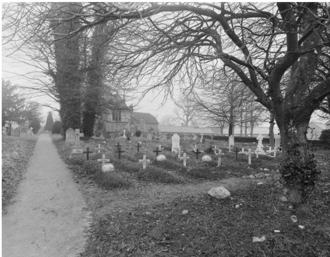
AUSTRALIAN WAR MEMORIAL

There was a 600 bed hutted military hospital at Fovant during the First World War, and the concentration of Australian depots and training camps in the area is reflected in the 63 First World War burials in this churchyard. The war graves form two groups, one west of the church and the other at the east end. There is also one burial of the Second World War. There are 44 War Graves belonging to those who served with the Australian Imperial Force in World War 1. (Information from CWGC)